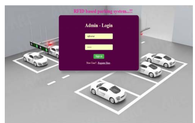
Fig 1. Admin Login