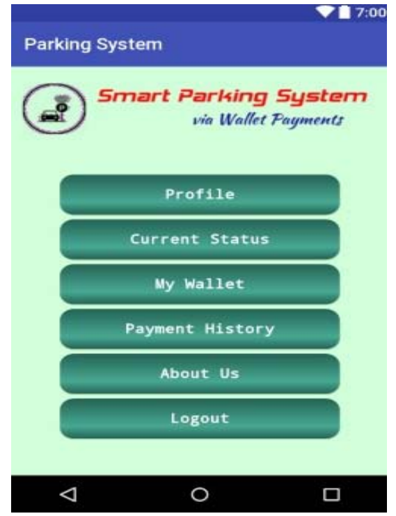
Fig5.User Home Page