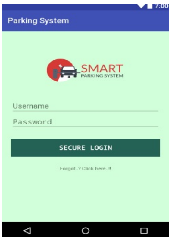
Fig4. User Login